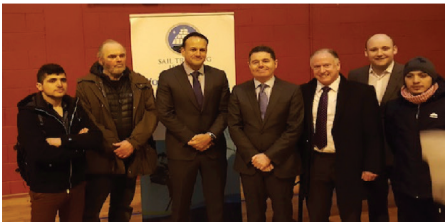
An Taoiseach Leo Varadkar and Minister for Finance Paschal Donohoe at the launch of the NEIC Sail Training Voyages

There was a fantastic air of anticipation at the first information meeting as the trainees were allocated to seven different ships. The excitement was increased when they realised it was a race and that they would be competing against one another. This amazing atmosphere was to continue right through the project.