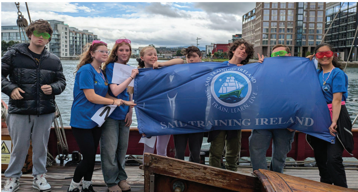
Trainees at the Awards ceremony.